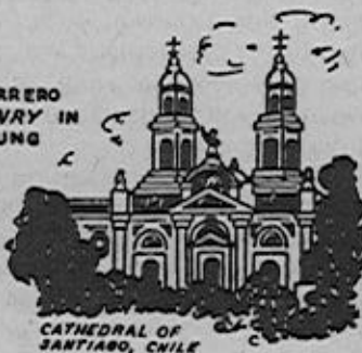
CATHEDRAL OF SANTIAGO, CHILE

POPE PIUS II (GIUSEPPE MARIA FERRERO MASTAI FERRETTI) JOINED FREEMASONRY IN SANTIAGO, CHILE, IN 1832, WHILE A YOUNG PRIEST. HE WAS THE SECRETARY OF THE PAPAL NUNCIO AT THE TIME.