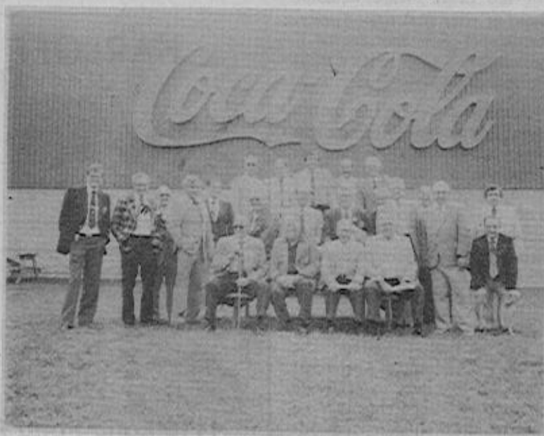
Ionic Lodge, Hamilton, Ontario visits Webster.