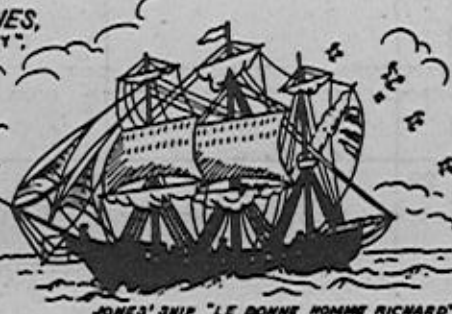
JONES' SHIP "LE BONHOMME RICHARD"

THE BODY OF JOHN PAUL JONES, "FATHER OF THE AMERICAN NAVY", WAS LOST FOR THIRTEEN YEARS. IT WAS EVENTUALLY DISCOVERED IN THE ST. LOUIS CEMETERY FOR FOREIGN PROTESTANTS IN PARIS AND REMOVED TO THE NAVAL CHAPEL IN ANNAPOLIS. HE WAS A MEMBER OF ST. BERNARD'S LODGE NO. 122, KIRKCUDBRIGHT, SCOTLAND.